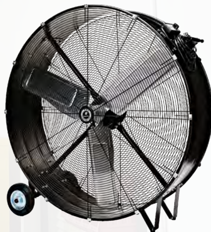
STATIONARY MODEL (CPB 36-D)

Meets Federal OSHA Requirements / 1 Year LIMITED WARRANTY