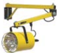
Highest Lumen Output!