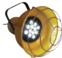
Fostoria Model #: DKL-LED