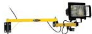
Highest Lumen Output! detected within the trailer area!