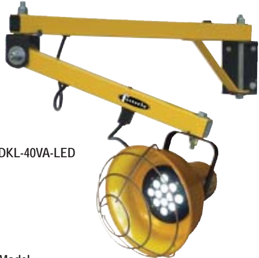
Fostoria Model #: DKL-40VA-LED