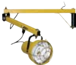
Lower wattage consumption & cool operating temperature!