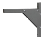
HV-2 ; 22" reach HV-3 ; 25" reach