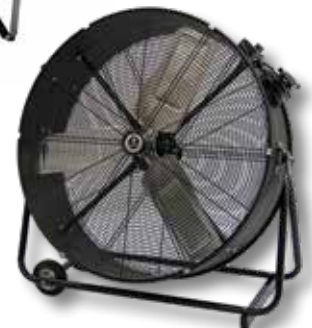
SWIVEL MODEL (CPBS 30-D)