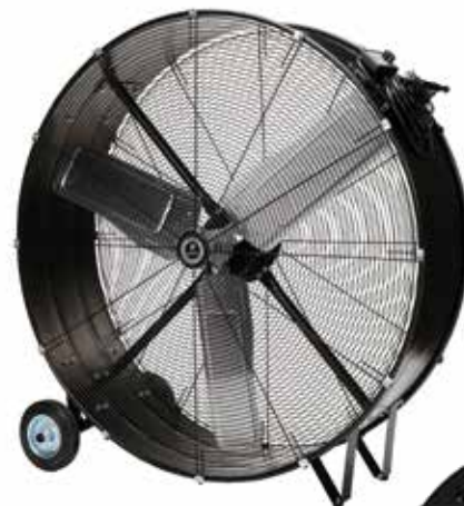
STATIONARY MODEL (CPB 36-D)